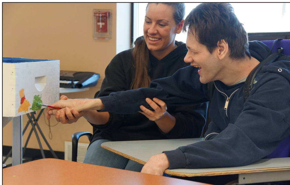
A 7 percent cut in funding would have a dramatic impact on how MSS provides services and programs for the people we support.